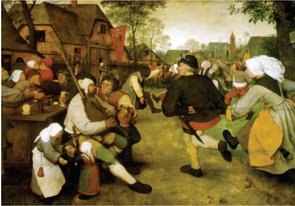
Pieter Breughel's "The Kermess"