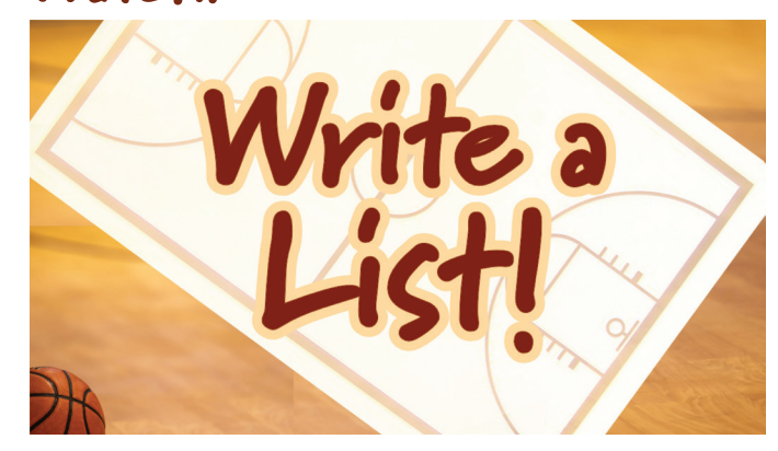
Watch the video "Write a List."