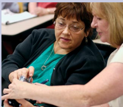
In July at the Stow Public Library, community members attended a workshop on videotaping oral histories.

PBS 45 & 49 would like to extend our deep gratitude to all who contributed to this oral history project. The touching and deeply personal stories that were shared will continue to educate and enlighten our viewers for years to come.